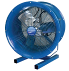
PB Pedestal Base 61 lbs