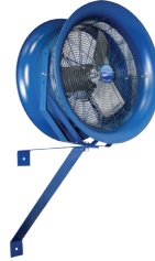
CW Column-Wall 62 lbs