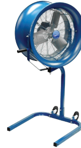
PS Portable Stroller 85 lbs